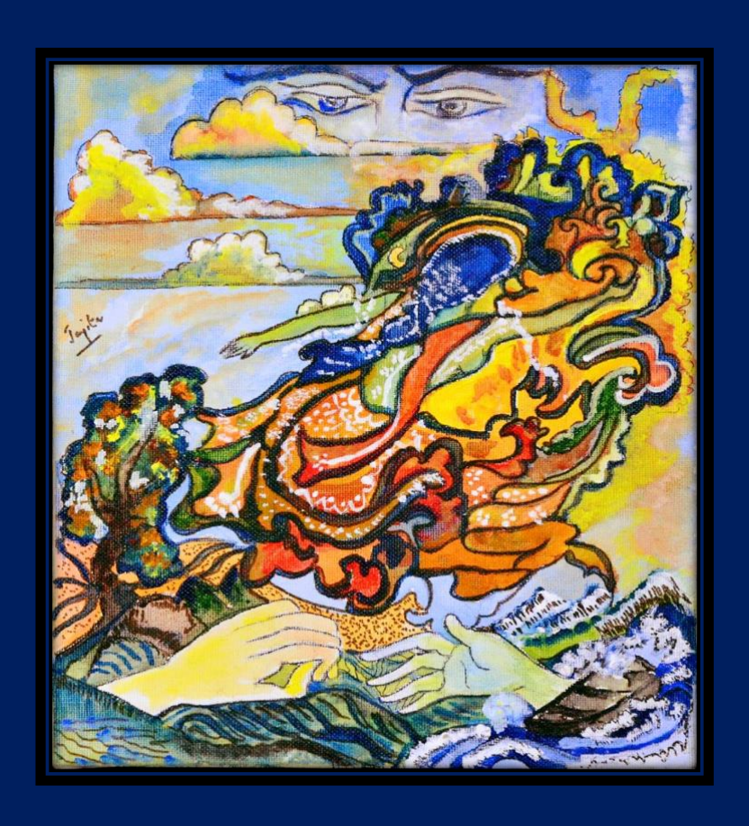
July - October 2023